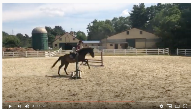
AEL VIRTUAL NATIONALS 2020/ Nashoba Valley/ #486